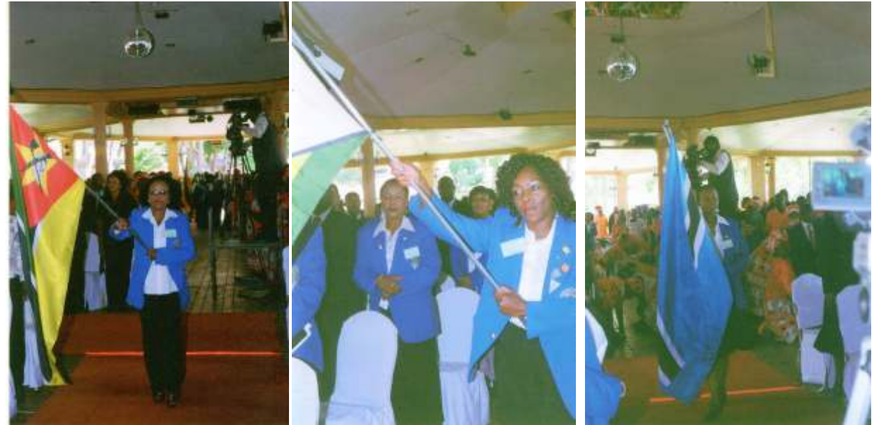
MozambiqueZimbabweBotswanaThe official opening started with the flag salutation of the four countries of District 412 accompanied by their<br/>National Anthems.